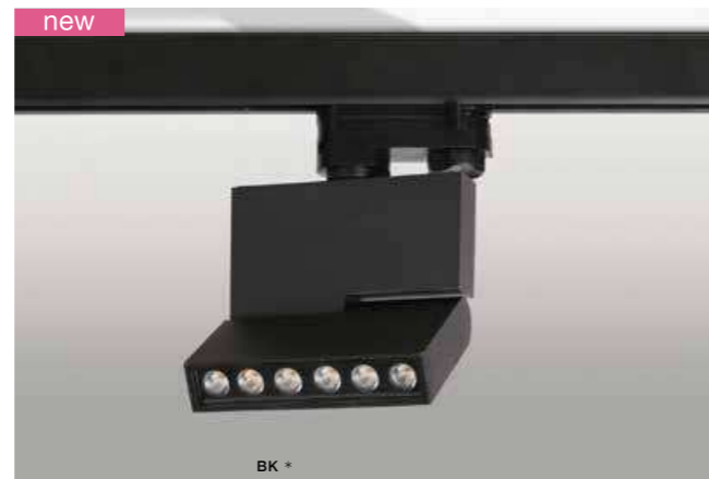
LEON 5 TRACK