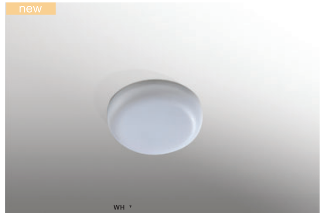
LAMIR R 12 IP44 3000K / 4000K