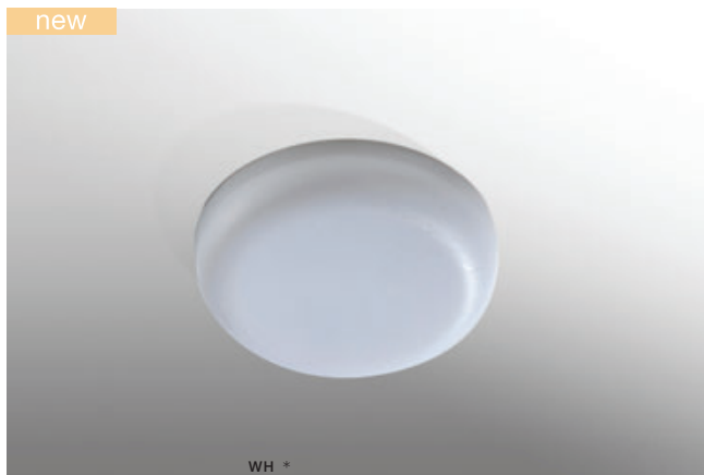
LAMIR R 17 DIMM IP44 3000K / 4000K