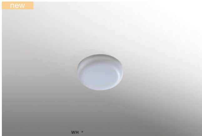
LAMIR R 9 IP44 3000K / 4000K