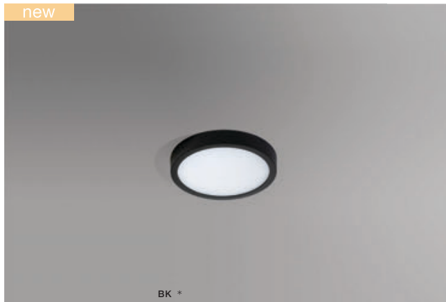
MALTA R 18 3000K / 4000K