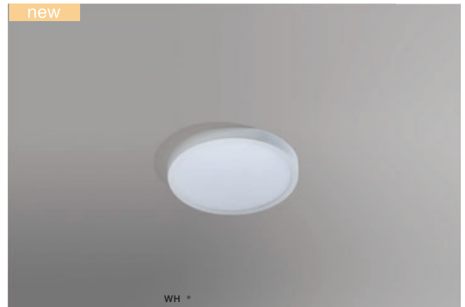
MALTA R 23 3000K / 4000K