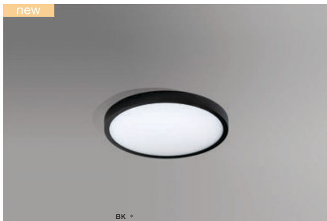
MALTA R 30 3000K / 4000K