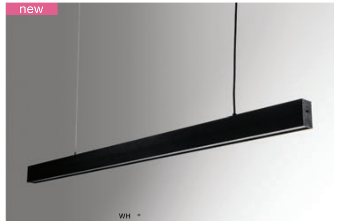
LINNEA 140 PENDANT CCT