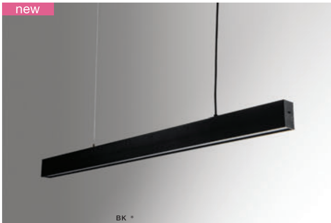
LINNEA 112 PENDANT CCT