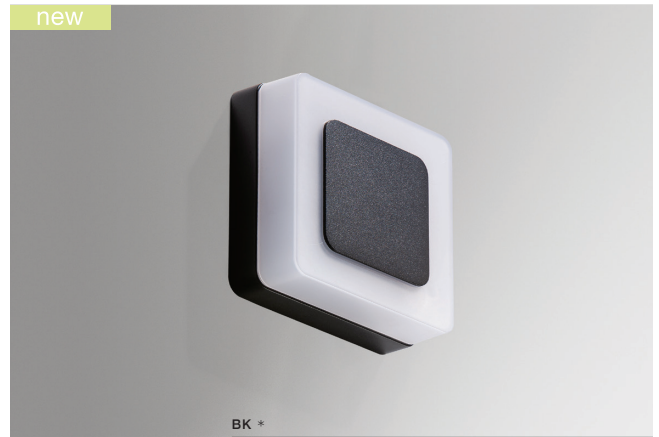
ENOK SQUARE WALL 3000K / 4000K