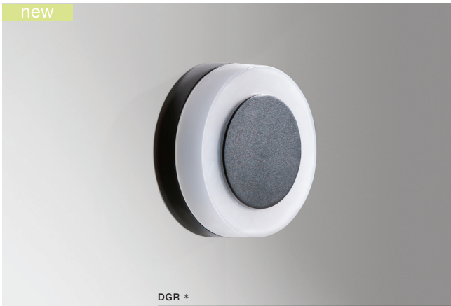
ENOK ROUND WALL 3000K